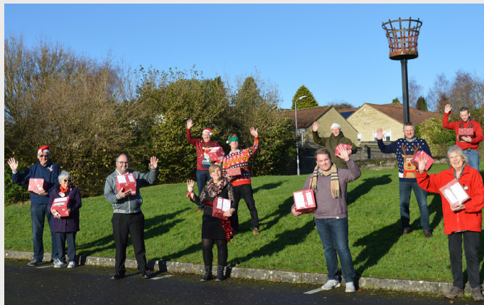
Community: Delivering Hampers