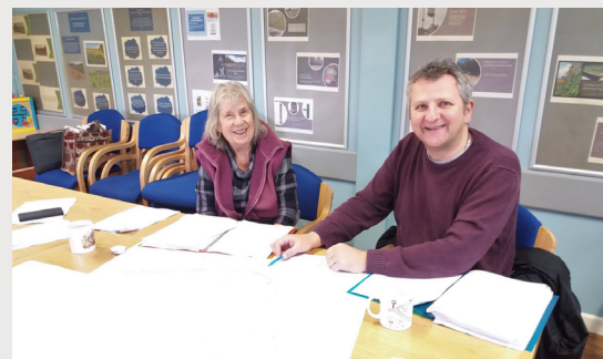
Environment: Aquisition of Land from Developers