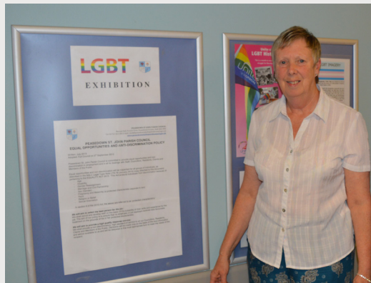
Campaigning: LGBT+ Exhibition, Beacon Hall