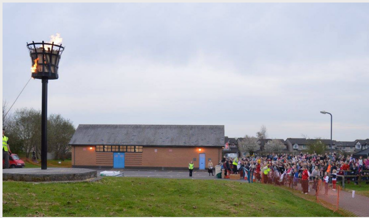
Civic Events: Jubilee Beacon Lighting