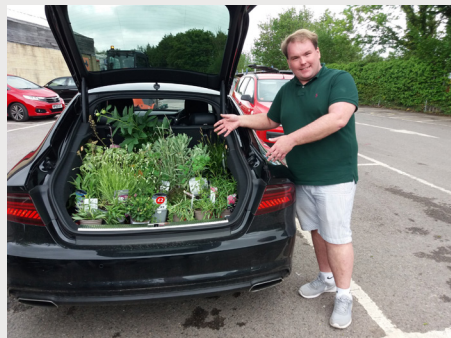
Projects: Jubilee Garden