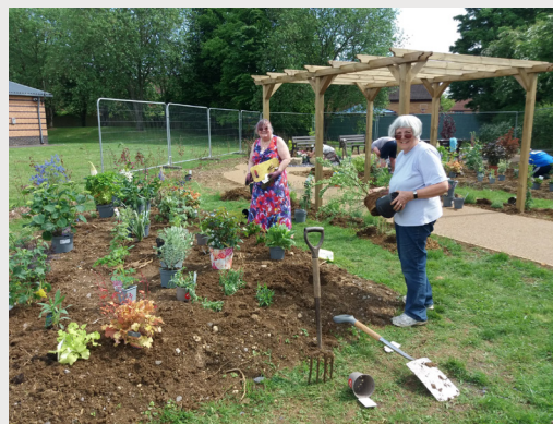
Projects: Jubilee Garden