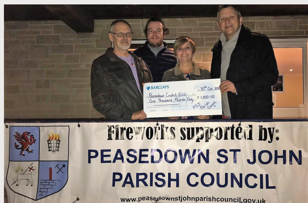
Community: Grants to Support Community