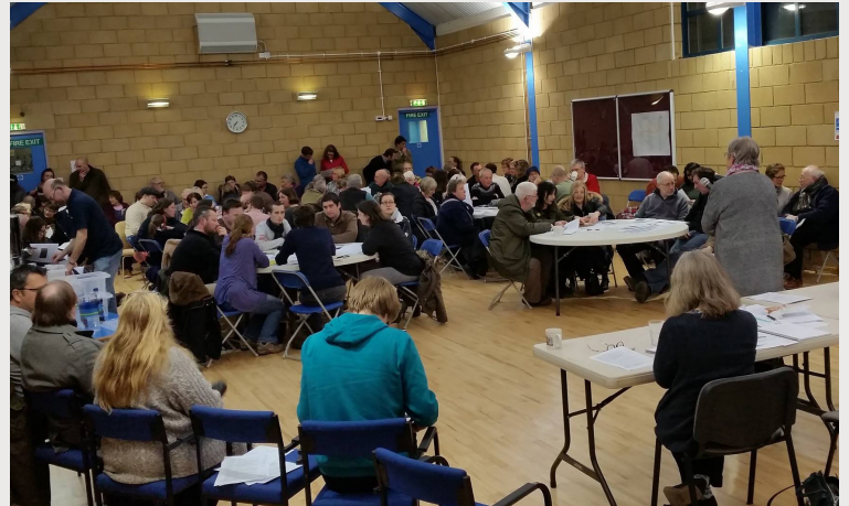
Meetings: Annual Village Meeting