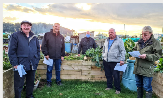
Allotment Management: Regular Allotment Inspection