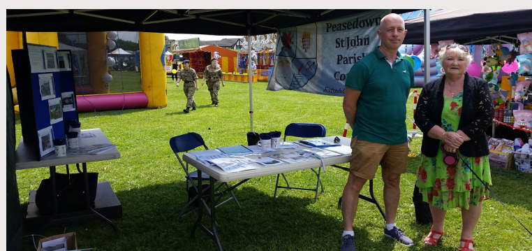
Community Engagement: Stall at Party in the Park