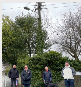
Maintenance: Street Lighting Inspection