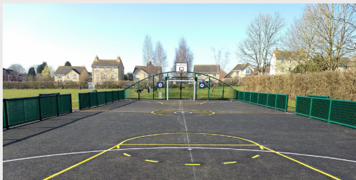
Projects: Installation of Multi-Use Games Area