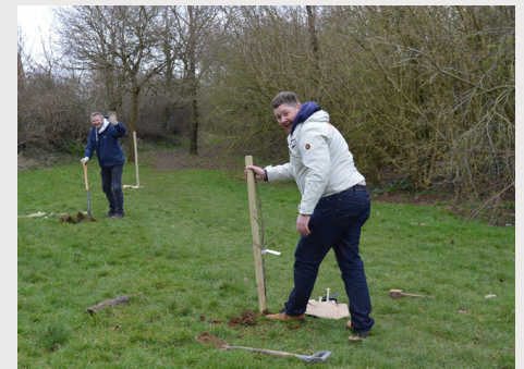
Environment: Tree Planting