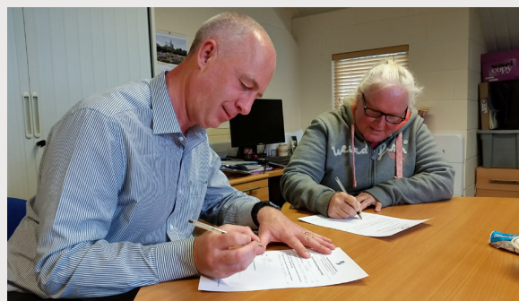
Governance: Signing to serve the Electorate and keep to the Code of Conduct