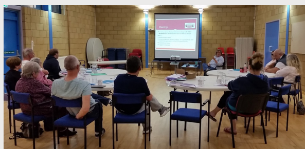
Councillor Training: Training session in Beacon Hall