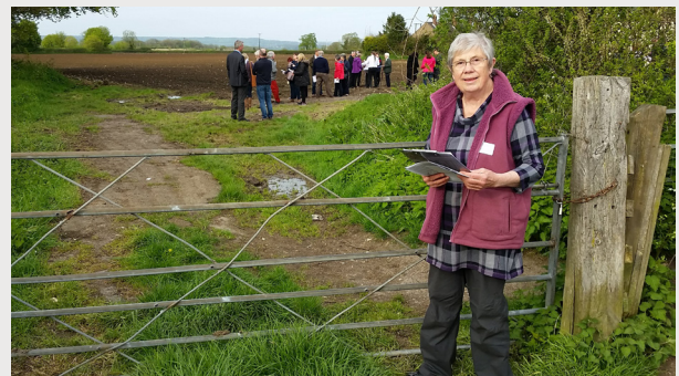
Planning: Input into Future Development