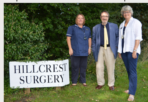
Campaigning: Working with Local Doctors' Surgery