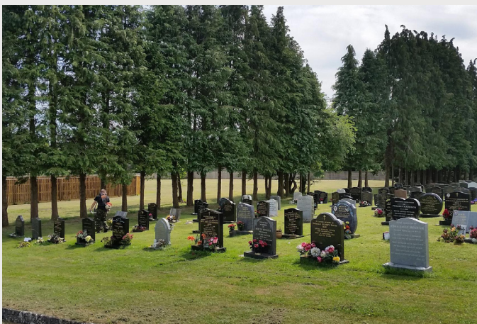
Facilities: Management of Ashgrove Cemetery