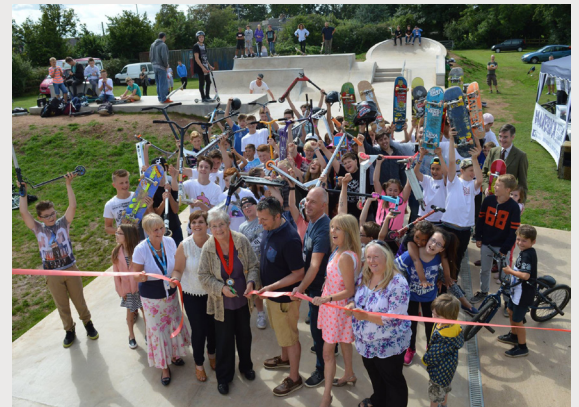
Projects: Opening the Skate Park