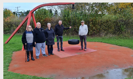
Maintenance: Play Surfaces on Beacon Field