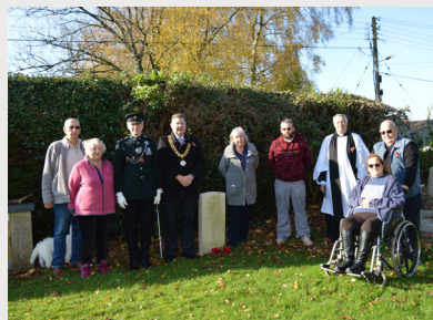
Civic Events: Remembrance - Dressing of War Graves