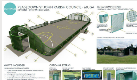
Projects: Installation of Multi-Use Games Area