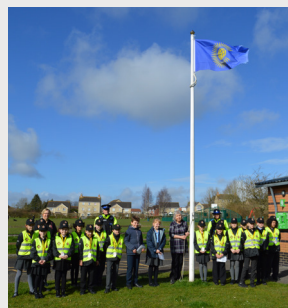
Civic Events: Commonwealth Day