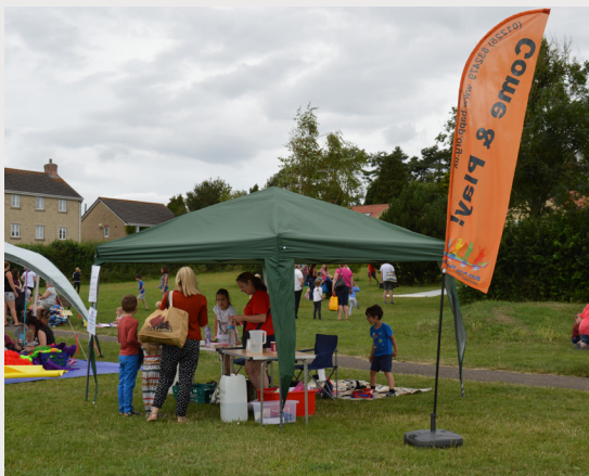
Photo shows the play day on Beacon Field in 2019

The second phase of Community Grants for 2022 has just started and is open for applications until 30th September 2022. If you run an organisation that benefits our community and would like to apply for a grant please contact the Parish Office (contact details above) or download an application form from the website.