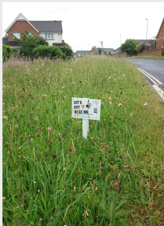
Some verges have been left longer to encourage wildflowers and bees

If you have any ideas or would like to become involved as a volunteer on future projects such as tree-planting, please get in touch with the Parish Office on the contact details given at the front of this newsletter.